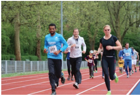
Runners at run4change